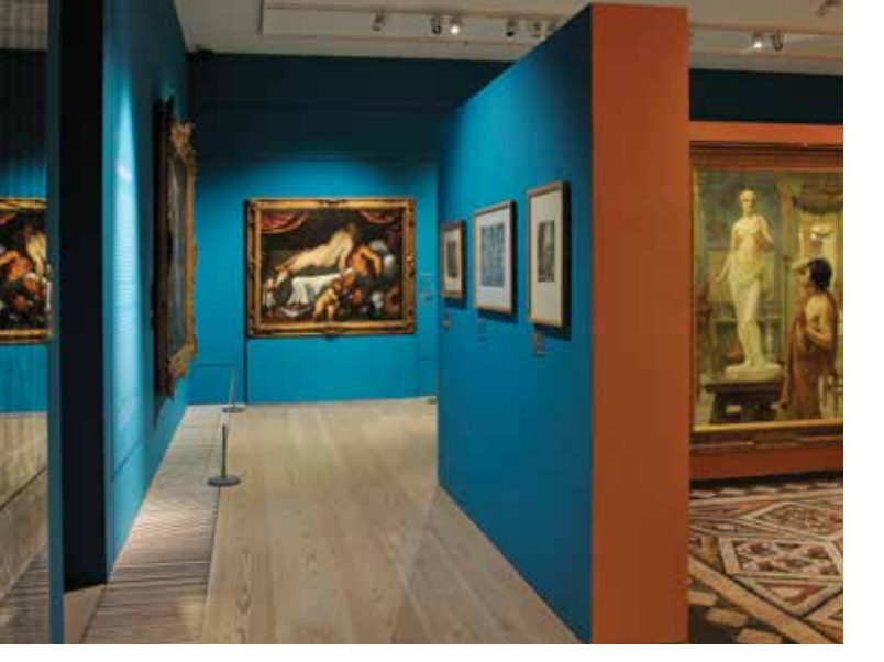
LEFT & RIGHT: View of the exhibition