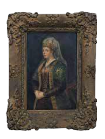
Caterina Cornaro painting - copy of the Titian's painting exhibited in the Uffizi Gallery AGLG 766