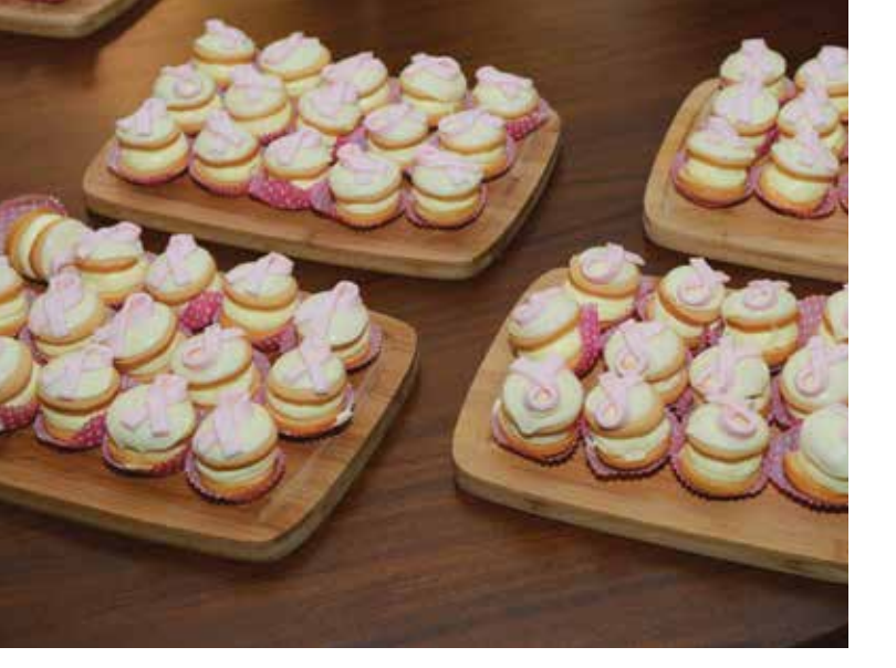
LEFT: Cup-cakes with Europa Donna Logo

event with the Red Cross. Ten educational stations were set up throughout the Gallery for our young friends to create arts and crafts to help a good cause.